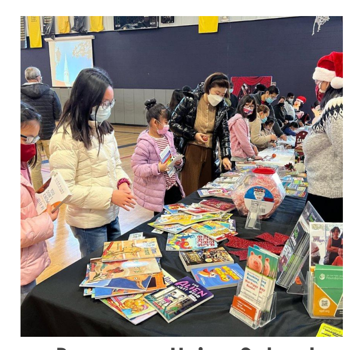
Berryessa Union School District Vaccine Event for kids with Berryessa Branch 300 books San José Public Library