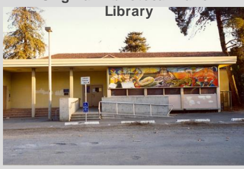
Current Biblioteca Branch