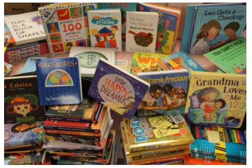
CASA foster families Holiday book gifts 400 books