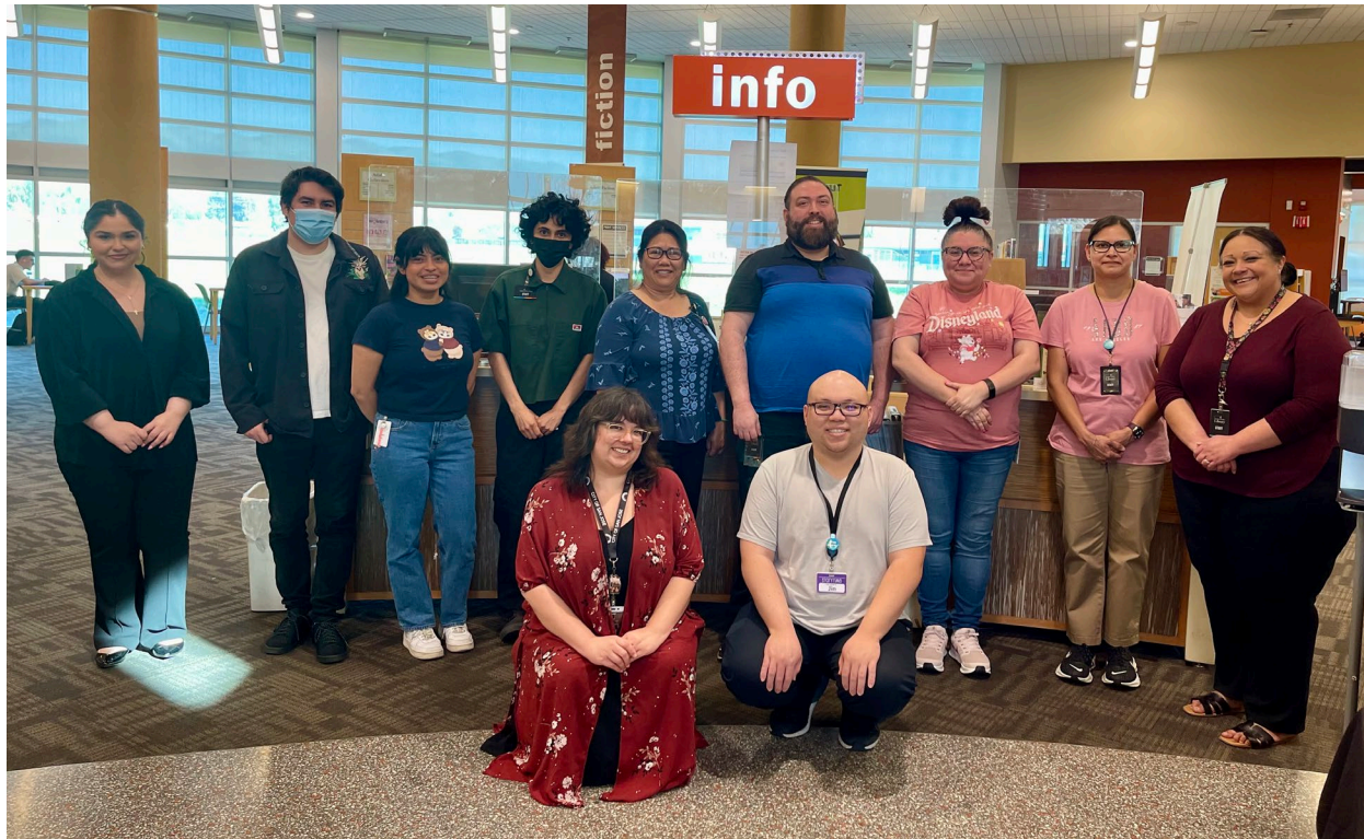
Members of the Hillview Branch Team