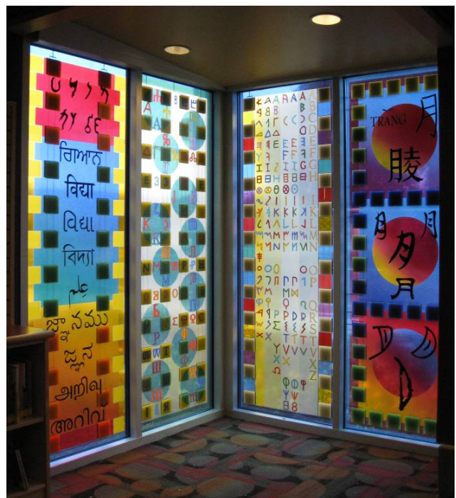
Windows – interior view (right); exterior detail of photovoltaic cells (below)

The artwork's visual imagery refers to ancient alphabets as the foundation of the written word, which in turn is fundamental to libraries and illumination of the mind. Each pane contains characters in different scripts that are the basis for written Latin, Russian, Vietnamese and some Indian languages. These are lineages of the languages that presently are predominant in the Pearl Avenue Branch Library collection. The lamp is inscribed with ancient Sumerian cuneiform script which repeats the text "We are all one." The lamp