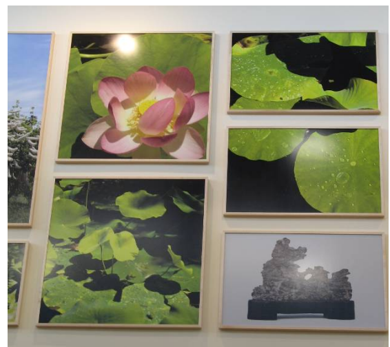
Detail of Nature Knowledge