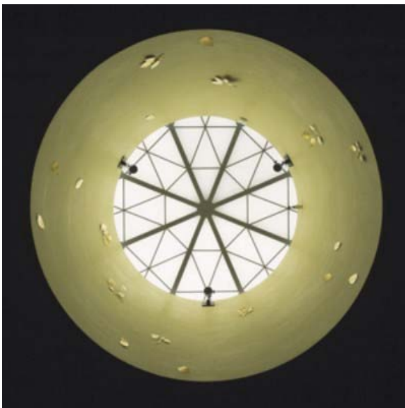
Above: Marketplace Skylight Well

The artwork is placed beneath four 8' diameter skylights within the library: