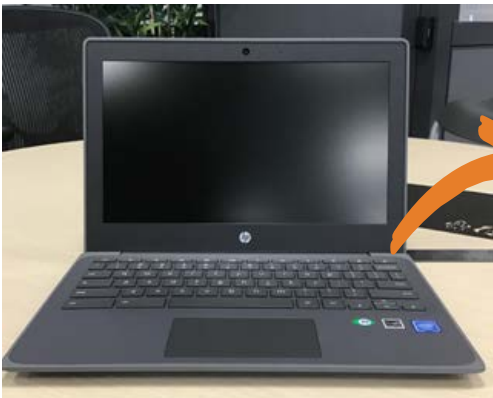
HP Chromebook 11

Available at all San José Public Library Locations