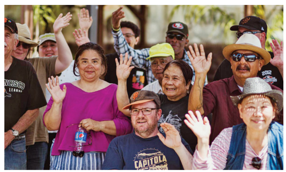
Grace Art and Wellness Program (GAW) members cheer during the San José Giants game as special guests to celebrate We Care Wednesday.

Although my solution is not to eradicate technology, if it is in everyone's hands to change our practices with it, let's live in the moment with the people around us and enjoy them. Smiling will strengthen us and give us happiness.