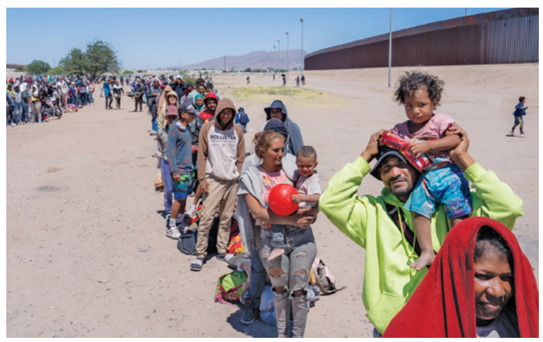
Published May 10, 2023, NY Times, Eileen Sullivan https://www.nytimes.com/2023/05/10/us/politics/title-42-border-history-immigration.html

Migrants, many from Venezuela, are gathering along the border fence in El Paso before the expected expiration this week of a rule limiting border crossings.